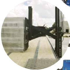
Optional Double Reach